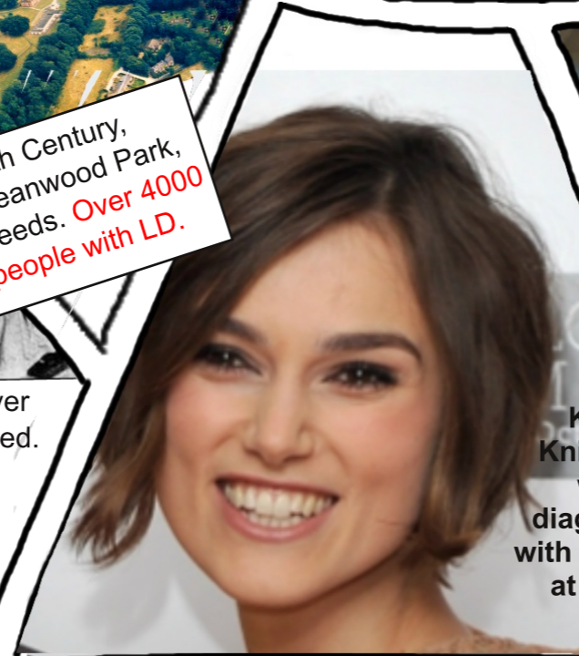
Keira Knightley was diagnosed with dyslexia at age 6.

20th Century, Meanwood Park, Leeds. Over 4000 people with LD.