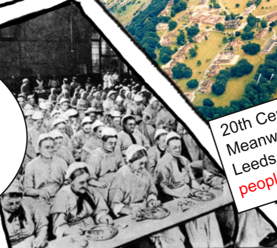
19th Century Workhouses- over 50% of residents were disabled.

In the past, people with LD were often seen as saints or demons. Henry VIII employed 'Natural fools' as jesters who lived in style at his palace at Hampton Court. The Tudors believed 'fools' told the truth, were pure and in touch with 'God'.