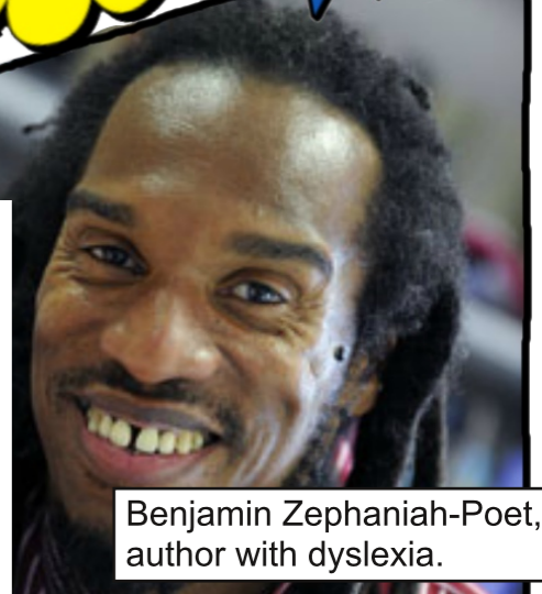
Benjamin Zephaniah-Poet, author with dyslexia.

Having a learning difficulty means finding it harder to learn certain skills. Each person is different but it can include learning new things, reading, writing, communication and managing money. Some people are born with a condition. Others may develop one as a result of an accident or illness.