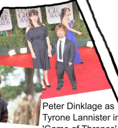
Peter Dinklage as Tyrone Lannister in 'Game of Thrones'.